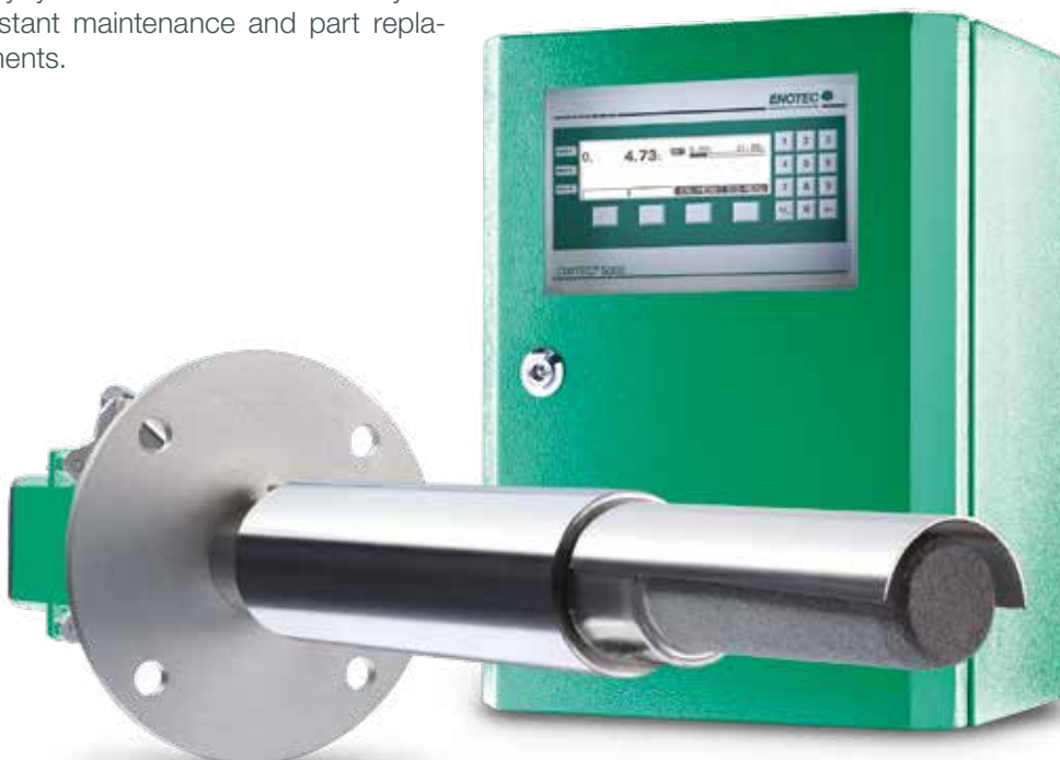
OXITEC Economy analyzer system

COST EFFICIENT AND MAINTENANCE FREE FOR MANY YEARS