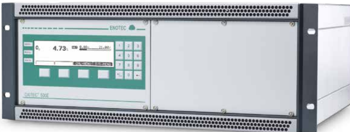
OXITEC 500E extractive analyzer