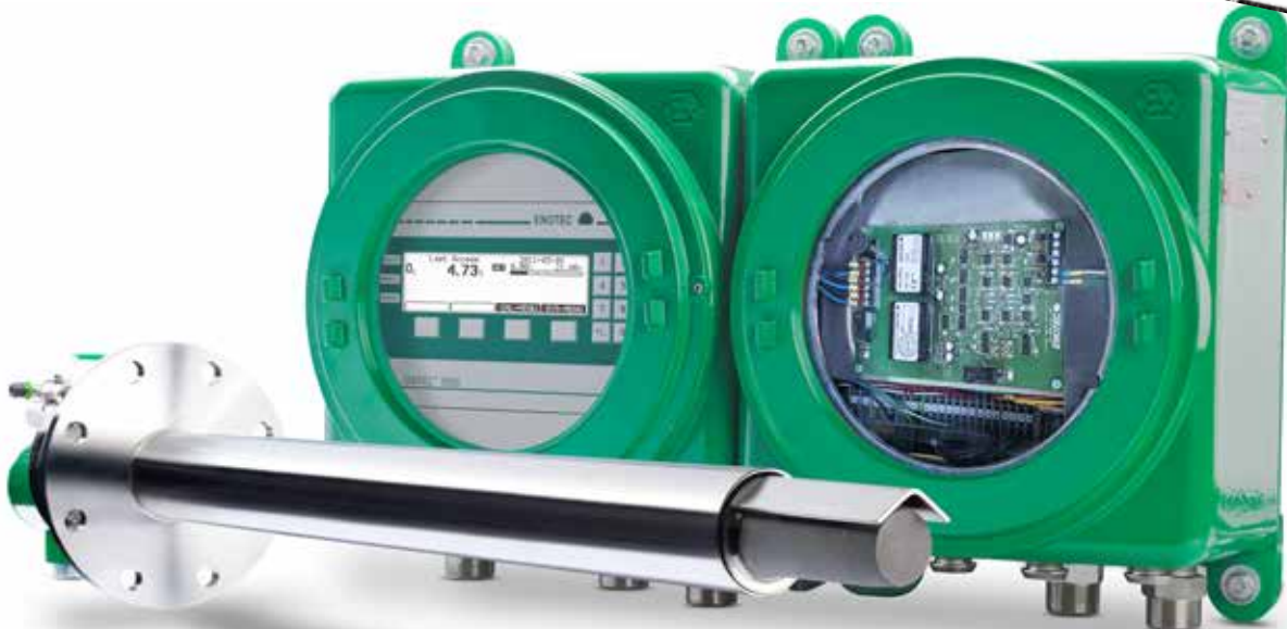
OXITEC 5000 GasEx analyzer system

ATEX APPROVED FOR YOUR PROCESS CONDITIONS