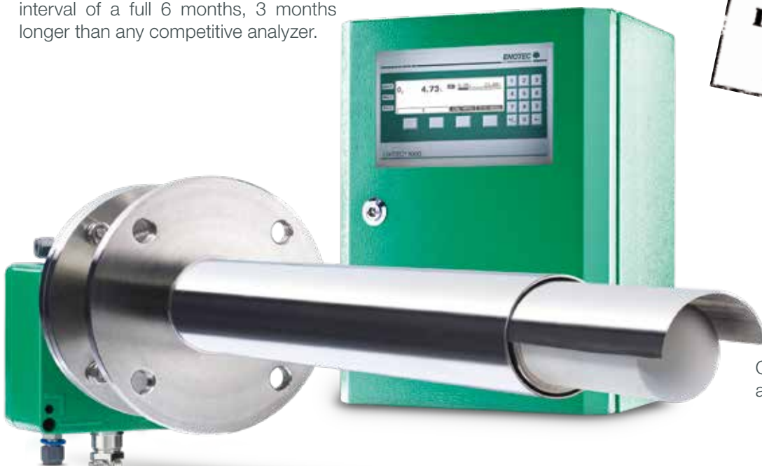
OXITEC 5000 safe area analyzer system

REDUCE EMISSIONS AND INCREASE FUEL EFFICIENCY