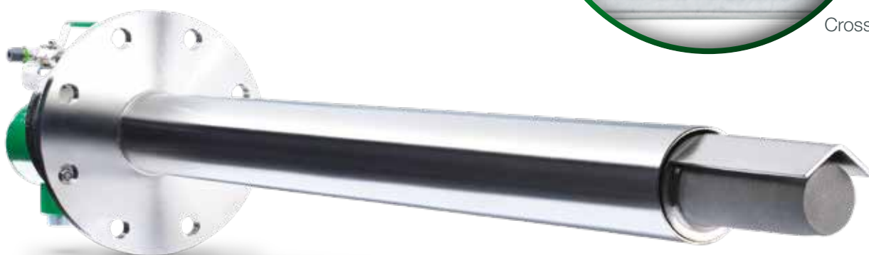
OXITEC KEX-5002 probe